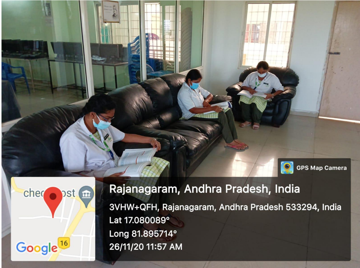
Library lounge area