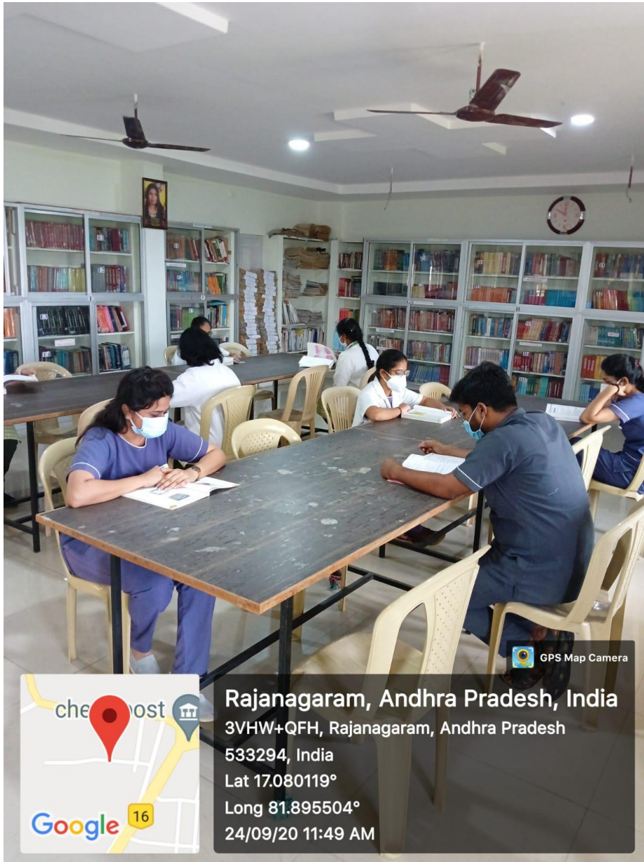
Reading room area