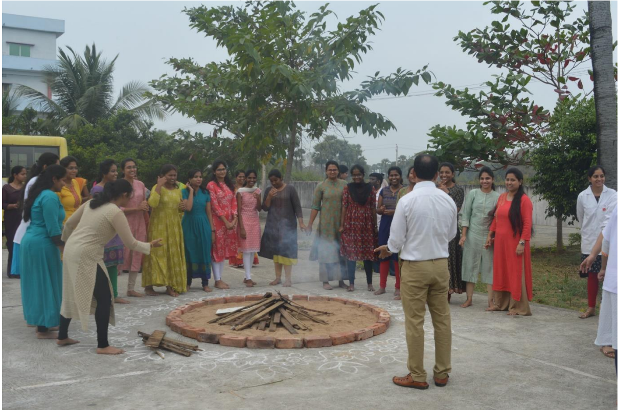
PONGAL CELEBRATION 10-1-2021