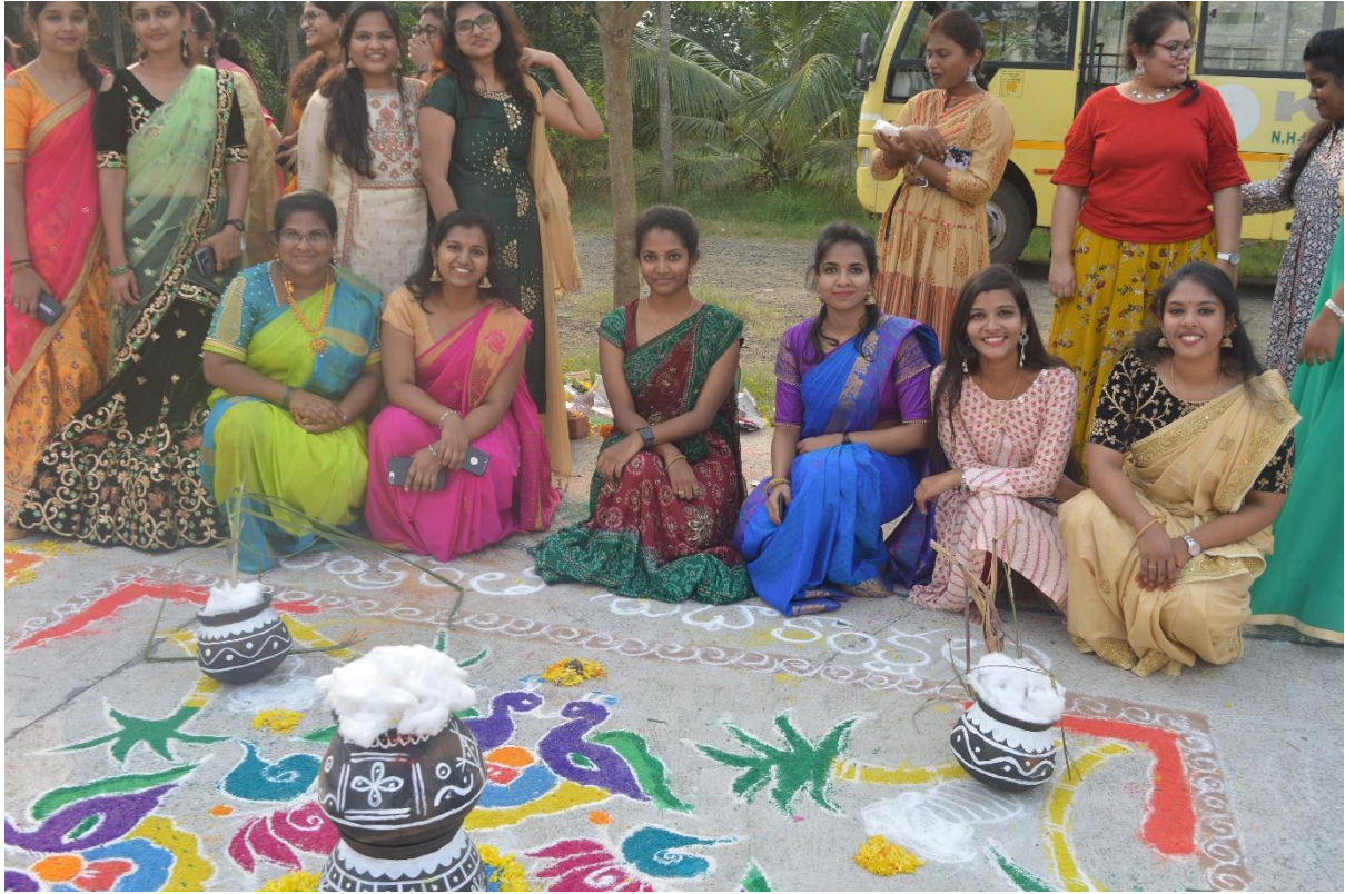
PONGAL CELEBRATION 10-1-2021